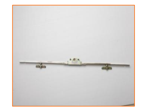
Multi Lock hinged open no key