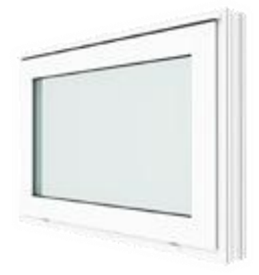
หน้าต่าวบานกระทุ้ว Awning Window