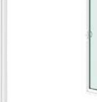
หน้าต่ามบานเปิดกู่ Double Casement Window