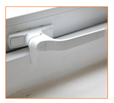
Comb Handle style