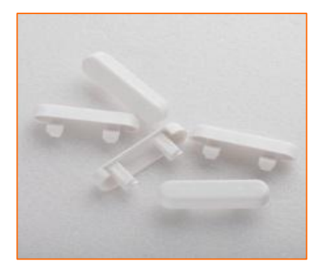
Cover for water