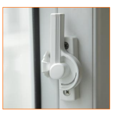
Shell handle style