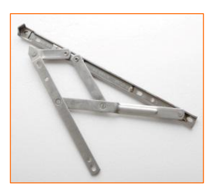
Visco three base