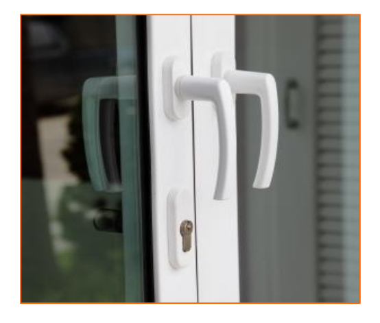
Europe handle style